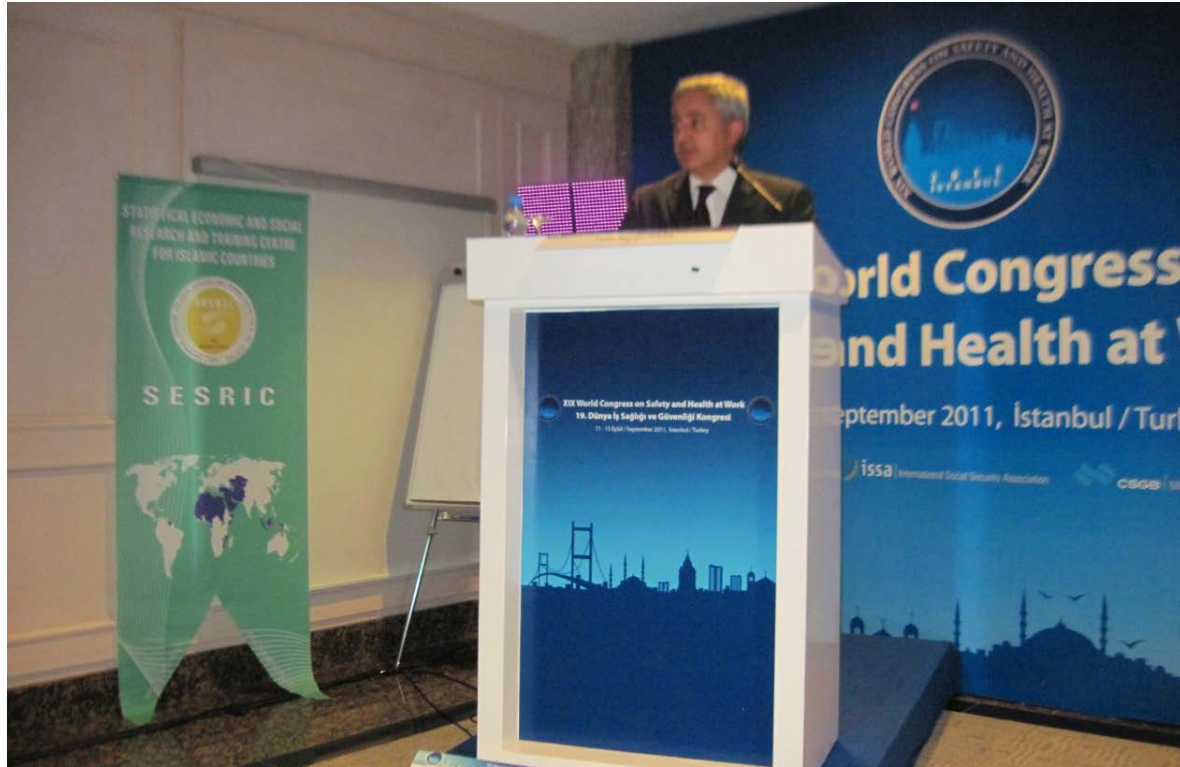
13 September 2011, ISTANBUL/ TURKEY Symposium on 'International Partnership in OSH Training' at XIX World Congress on Safety and Health at Work