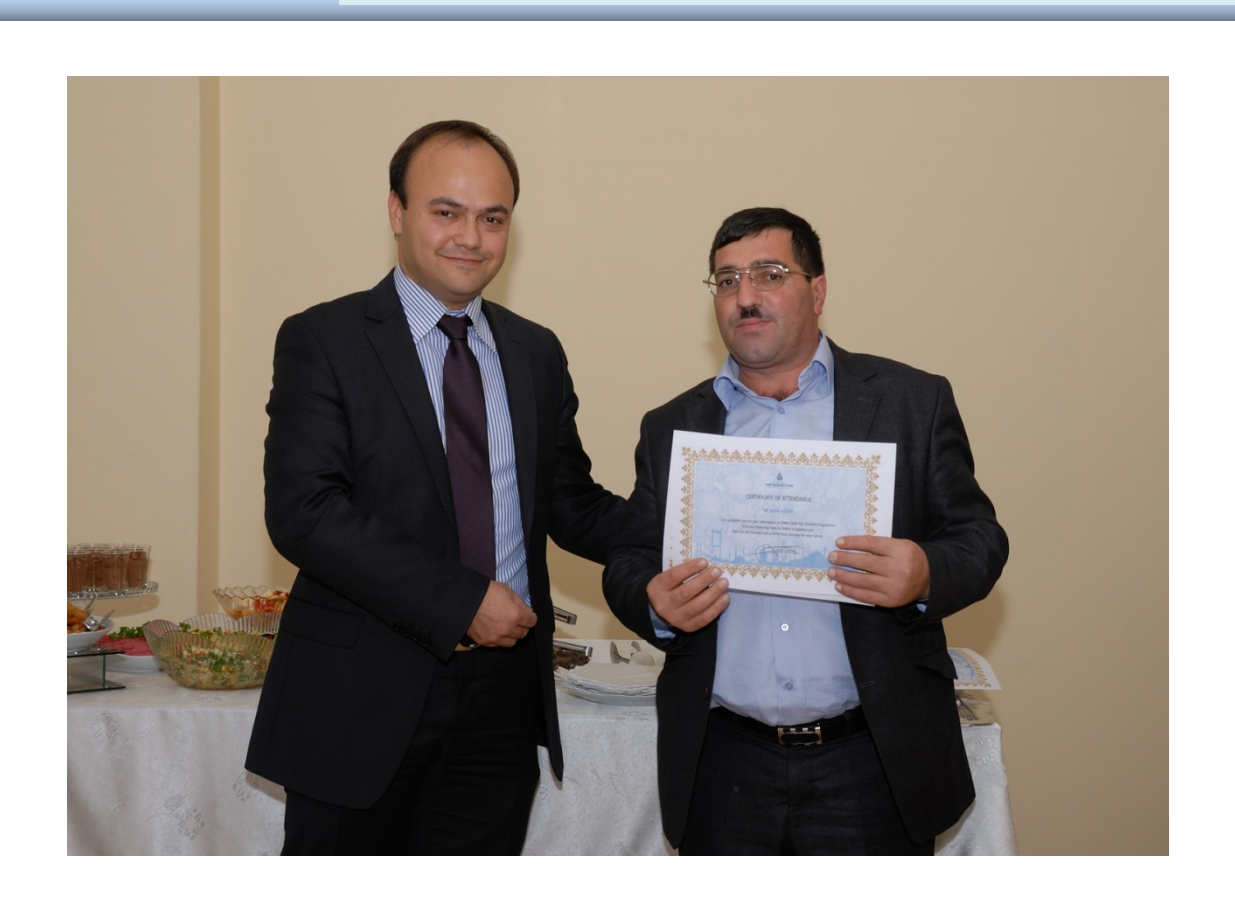
24 – 28 OCTOBER 2011, ISTANBUL / TURKEY Certificate Ceremony of the Master Trainers from Republic of Azerbaijan