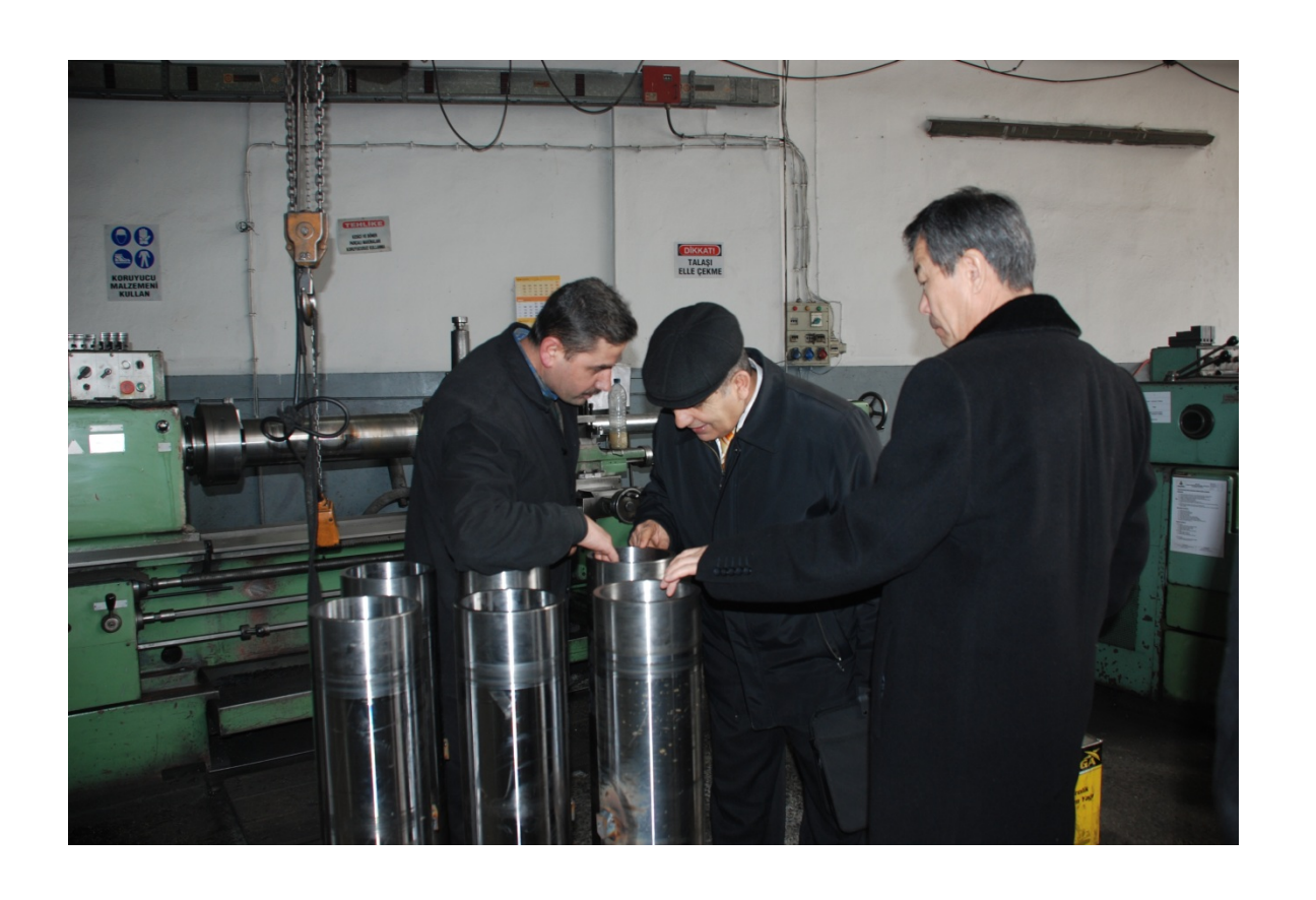
11-13 January 2012, ANKARA / TURKEY Study Visit on Skill Development for Youth Employment