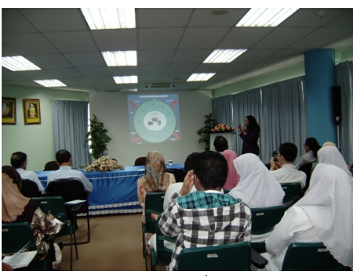
19-21 April 2011, BANDAR SERİ BAGAWAN / BRUNEI Training Course on 'Occupational Health and Safety'