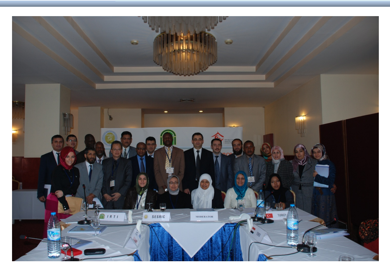
12-14 December 2011, ANKARA / TURKEY Workshop on Innovative Social Assistance Strategies in Poverty Alleviation