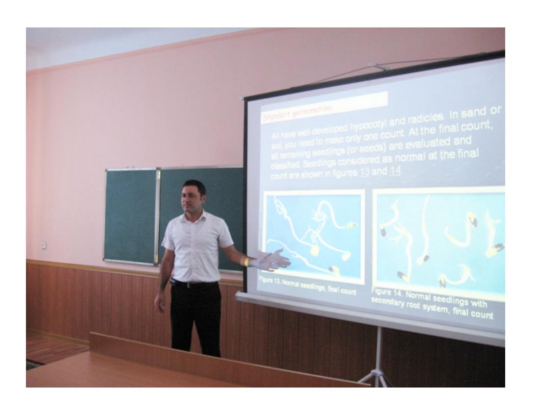
28-30 September 2011, ATAKENT / KAZAKHSTAN Training Course on 'Quality Improvement: Seed Quality and Preparation'