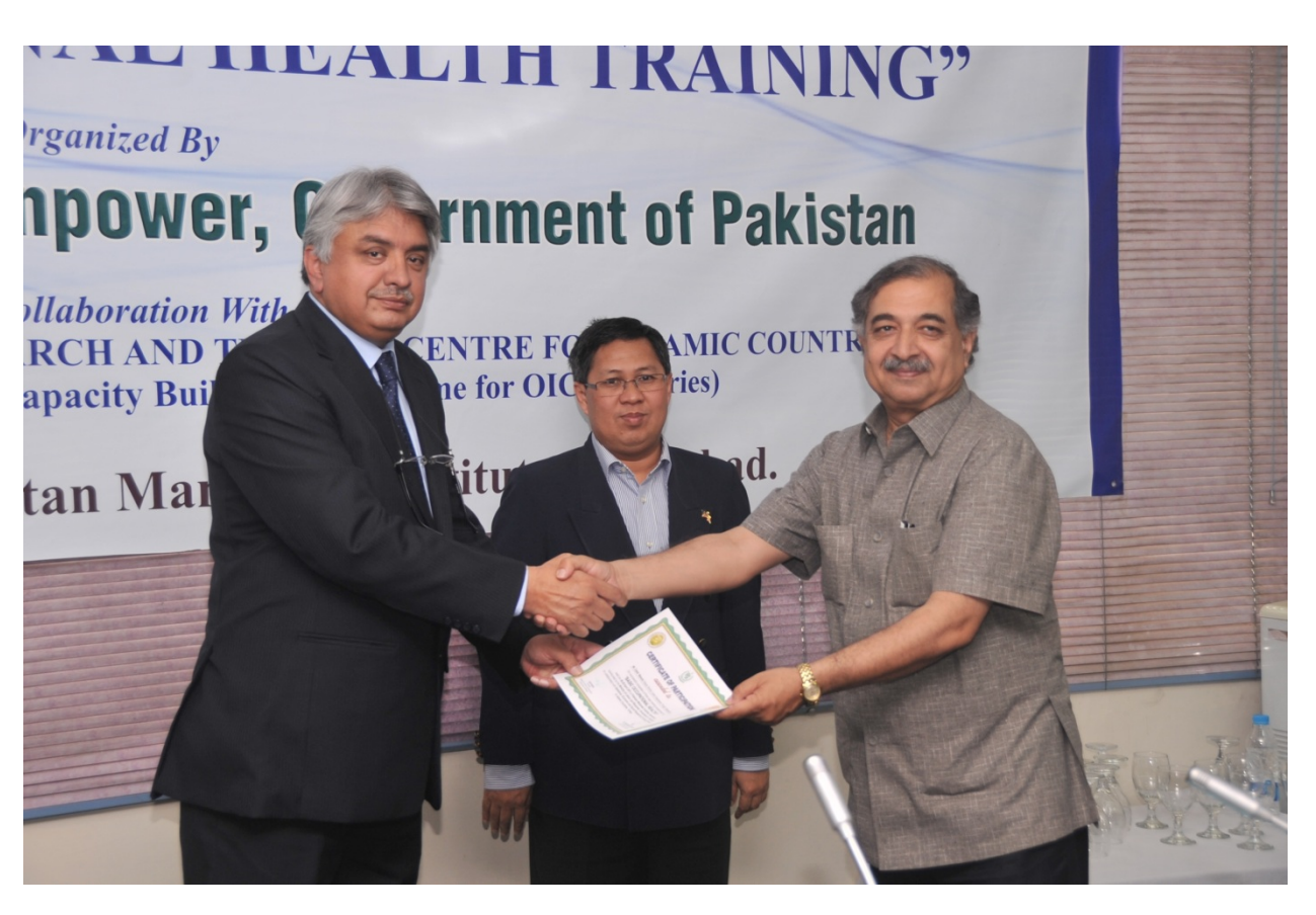
26-28 April 2011, ISLAMABAD / PAKISTAN Training Course on 'Occupational Health and Safety' in Pakistan