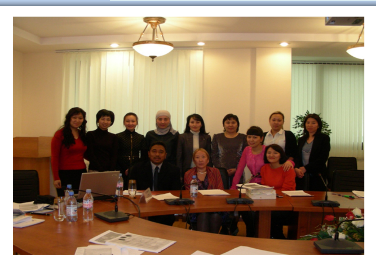
31 October - 02 November 2011, ASTANA / KAZAKHSTAN Training Course on 'Quarterly National Accounts'