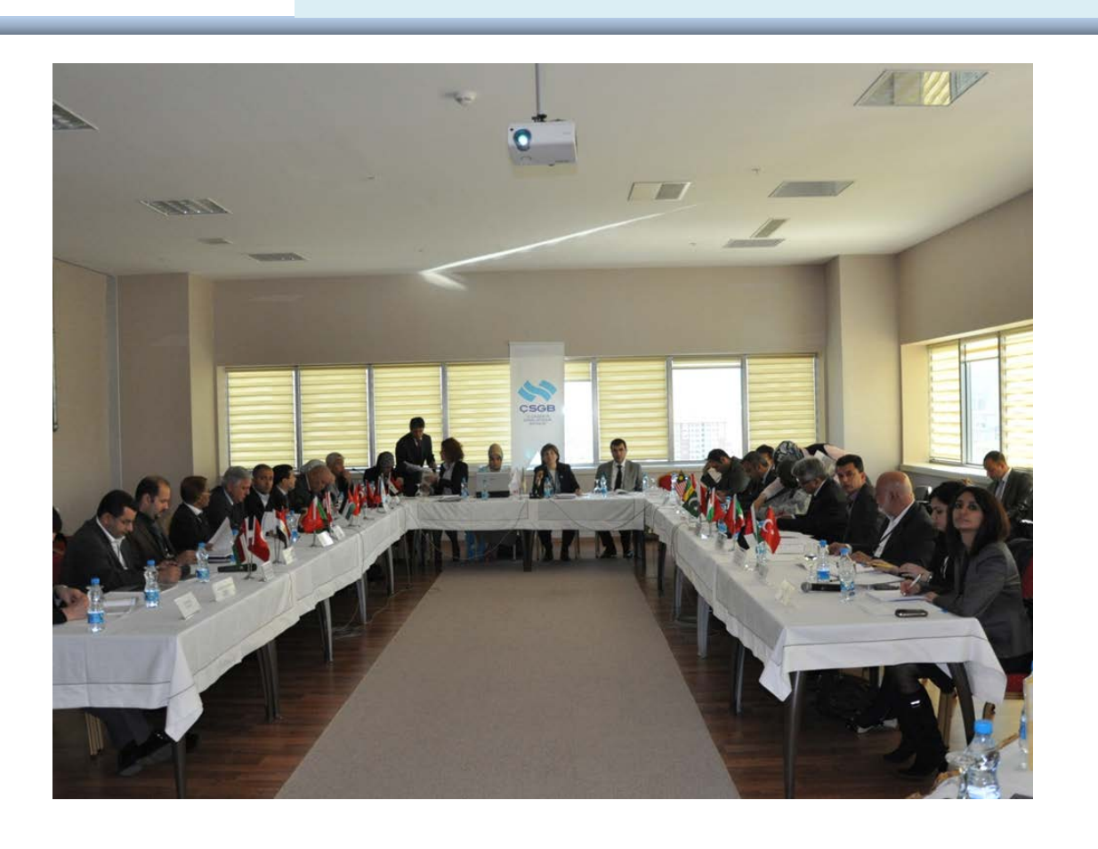
16-17 May 2011, ANKARA / TURKEY Kick-off Meeting of OIC-OSHNET