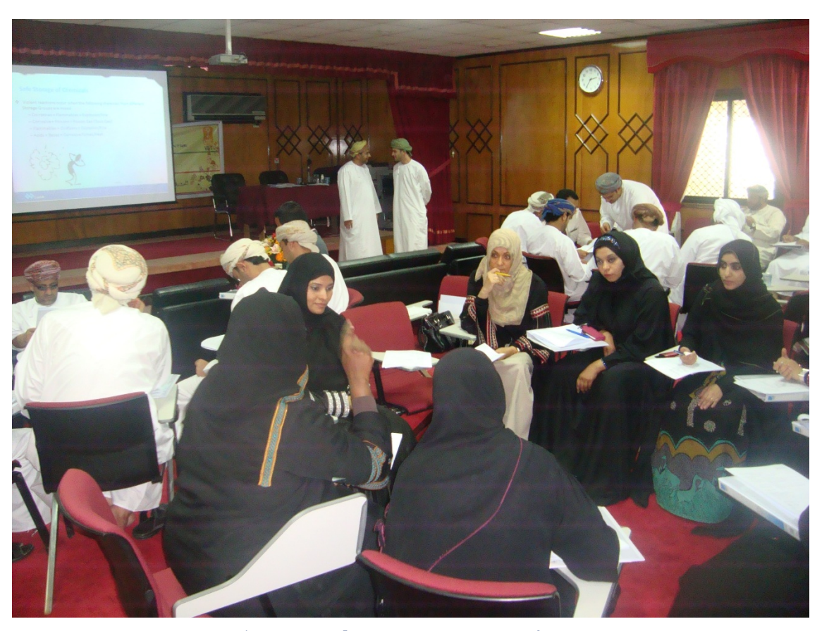
25-27 April 2011, MUSCAT / OMAN Training Course on 'Occupational Hygiene: Chemical Factors and Chemical Exposure'