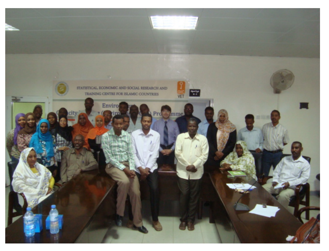
23-24 November 2011, KHARTOUM / SUDAN Training Course on 'Water Resources Management'