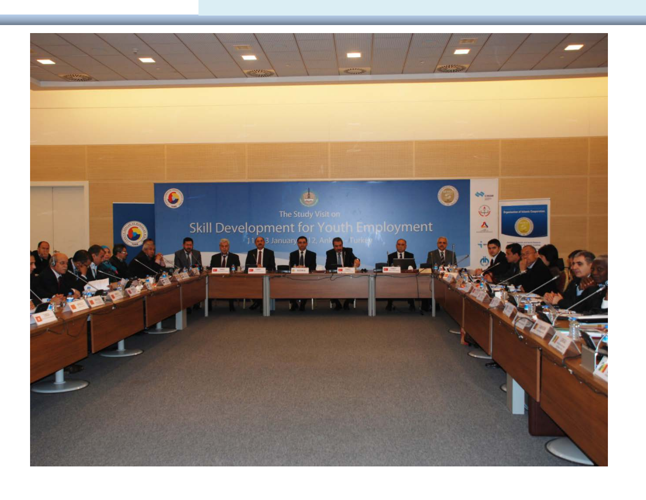
11-13 January 2012, ANKARA / TURKEY Study Visit on Skill Development for Youth Employment