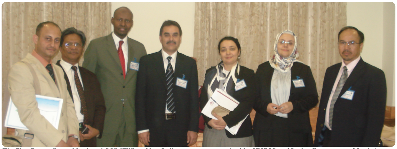
The First Expert Group Meeting of OIC-SWG on New Indicators was co-organized by SESRIC and Jordan Department of Statistics.

and Jordan Department of Statistics (DOS). Experts from Bahrain, Malaysia, Palestine, Saudi Arabia, Syria, Tunisia, United Arab Emirates, Yemen and the Islamic Development Bank participated in the meeting.