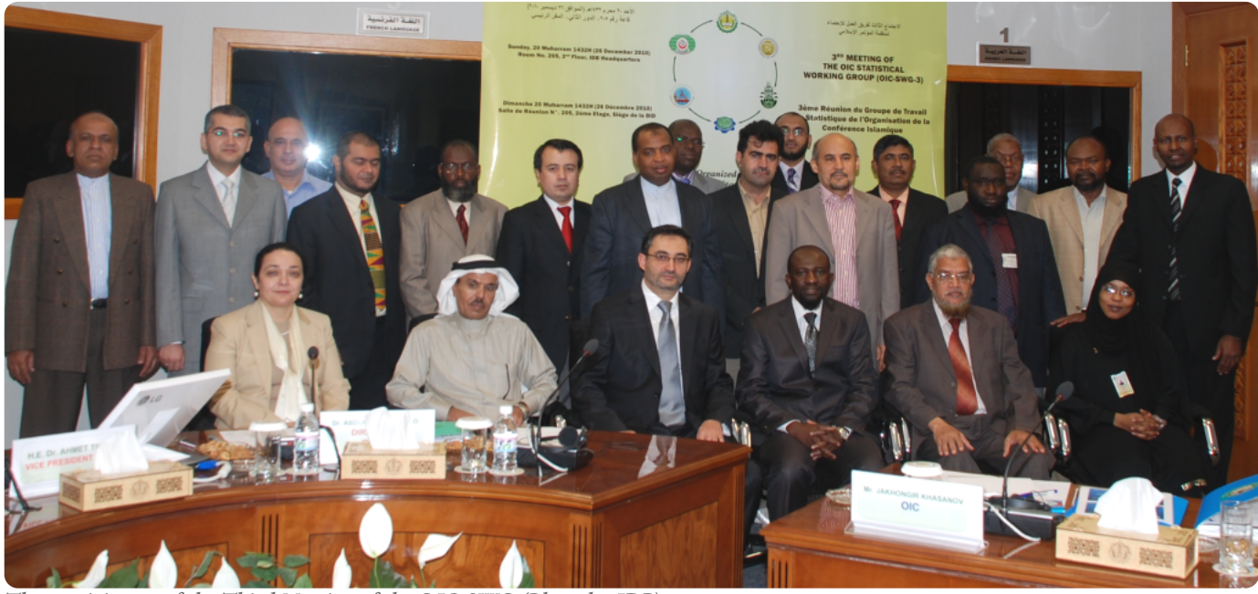
The participants of the Third Meeting of the OIC-SWG.

future meetings of the OIC-SWG in line with the sessions of the OIC Statistical Commission in order to have a higher participation rate from the National Statistical Offices (NSOs) of the OIC Member States.