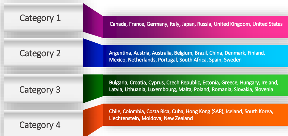
Figure 1: Countries Covered by GMD Project

The GMD project aims to address all Muslim communities and minorities that live in non-OIC Member States. However, due to various limitations and logistical considerations, it initially involves secondary data collection for 48 countries grouped in four categories. As shown in Figure 1, first category includes the G8 countries, second category comprises G20 and other major EU countries, third category largely consists of the remaining EU Countries and fourth category includes all remaining host countries with a sizeable Muslim communities and minorities.