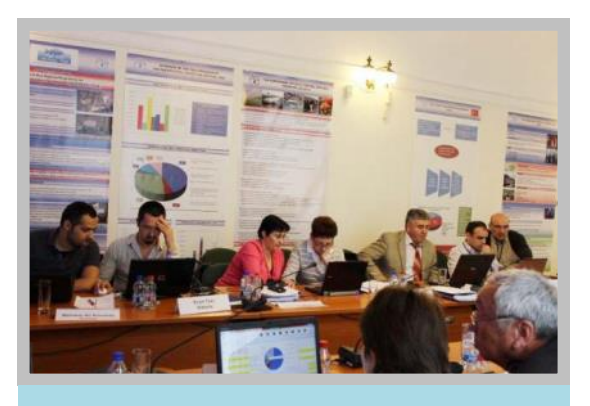
Budapest , Hungary

The objective of the workshop was to enhance the capacity of national experts in processing food consumption data collected in National Household Surveys (NHS) to derive food